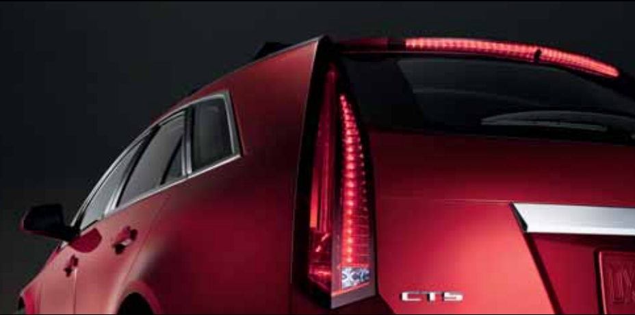
CTS SPORT WAGON