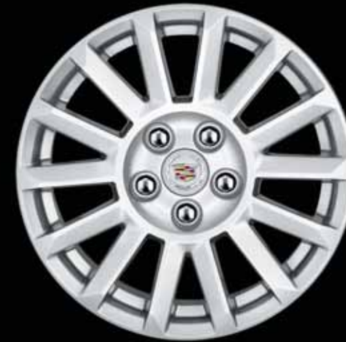
17" CAST ALUMINUM WHEELS WITH PAINTED FINISH

Standard and with Luxury Collection on CTS Sport Sedan and CTS Sport Wagon Size: 17" x 8" front and rear