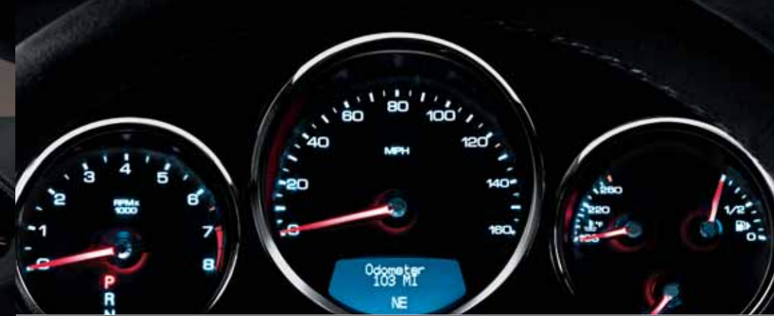
MOTORCYCLE-INSPIRED HIGH-PERFORMANCE GAUGES