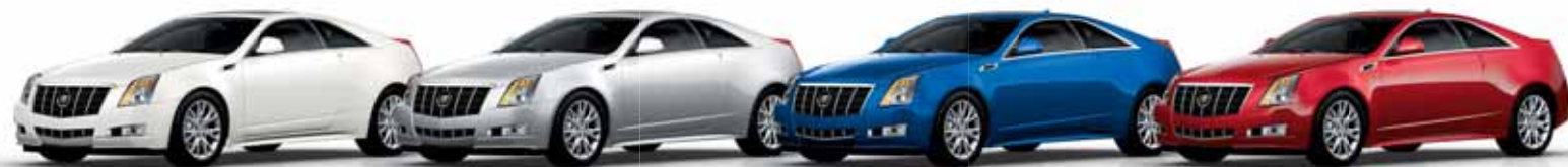
WHITE DIAMOND TRICOAT