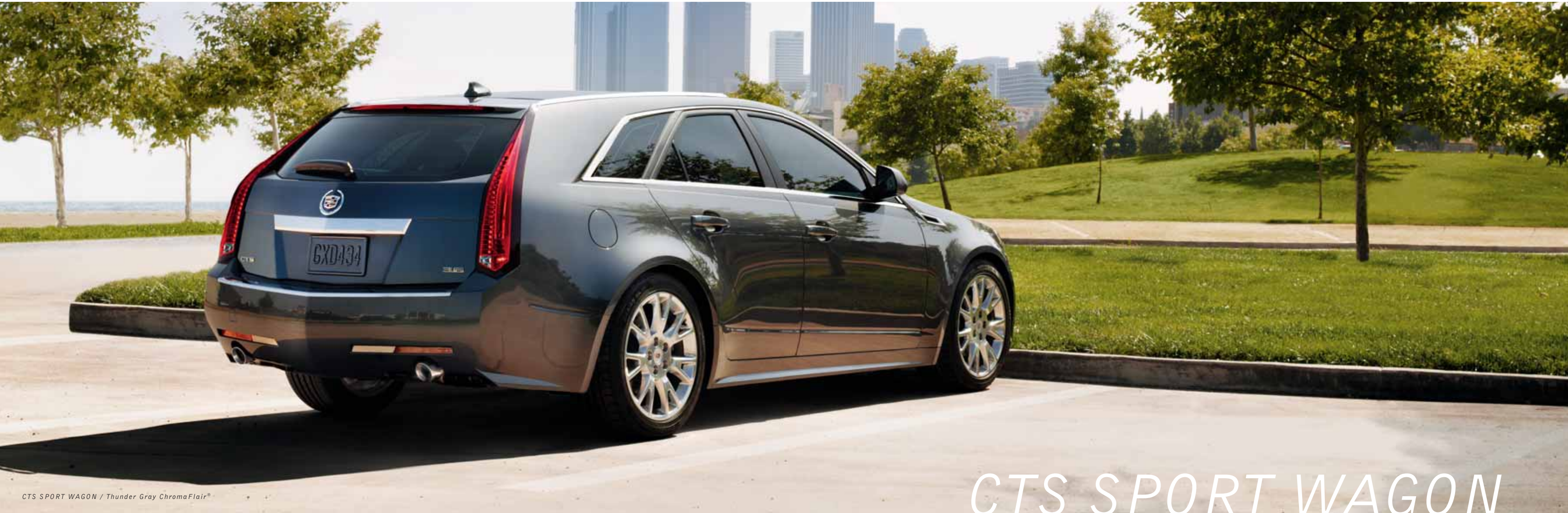
CTS SPORT WAGON / Thunder Gray ChromaFlair®