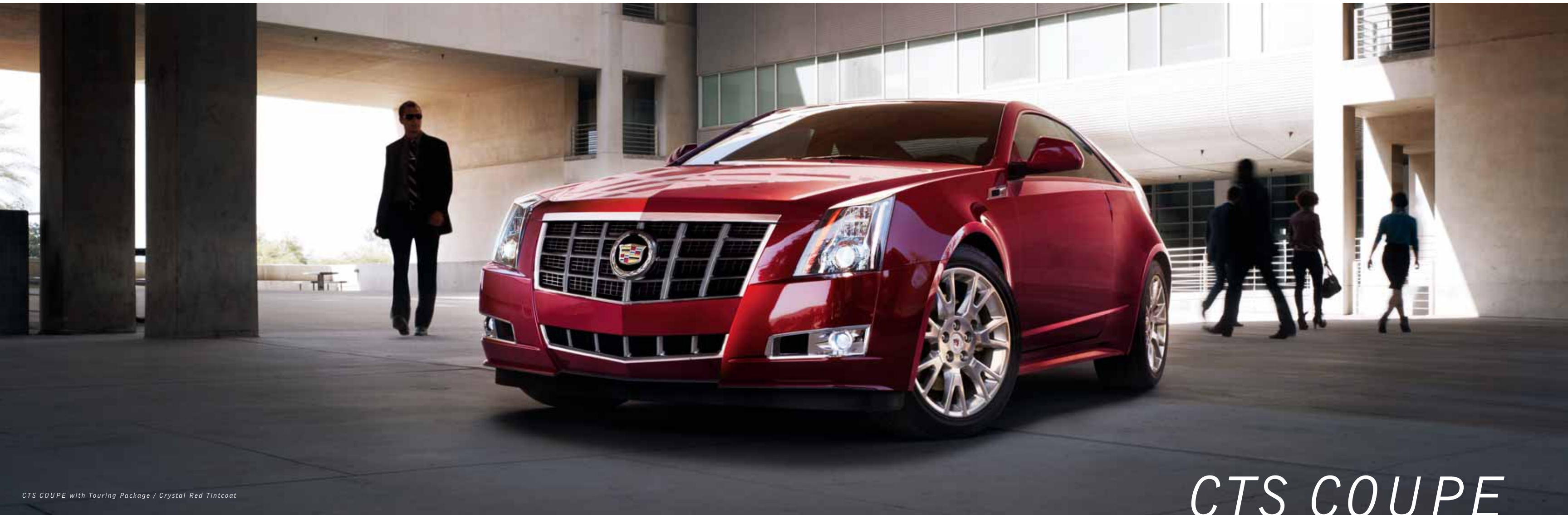
CTS COUPE with Touring Package / Crystal Red Tintcoat