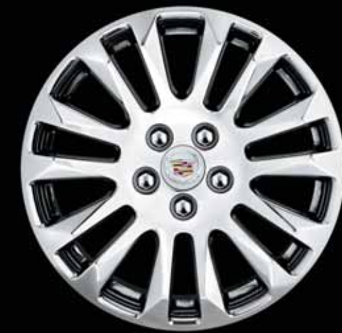
18" CAST ALUMINUM WHEELS WITH HIGH-POLISHED FINISH

Standard on CTS Coupe; standard on CTS Sport Sedan and CTS Sport Wagon with Performance Collection Sedan/Wagon size: 18" x 8.5" front and rear Coupe size: 18" x 8.5" front/18" x 9" rear