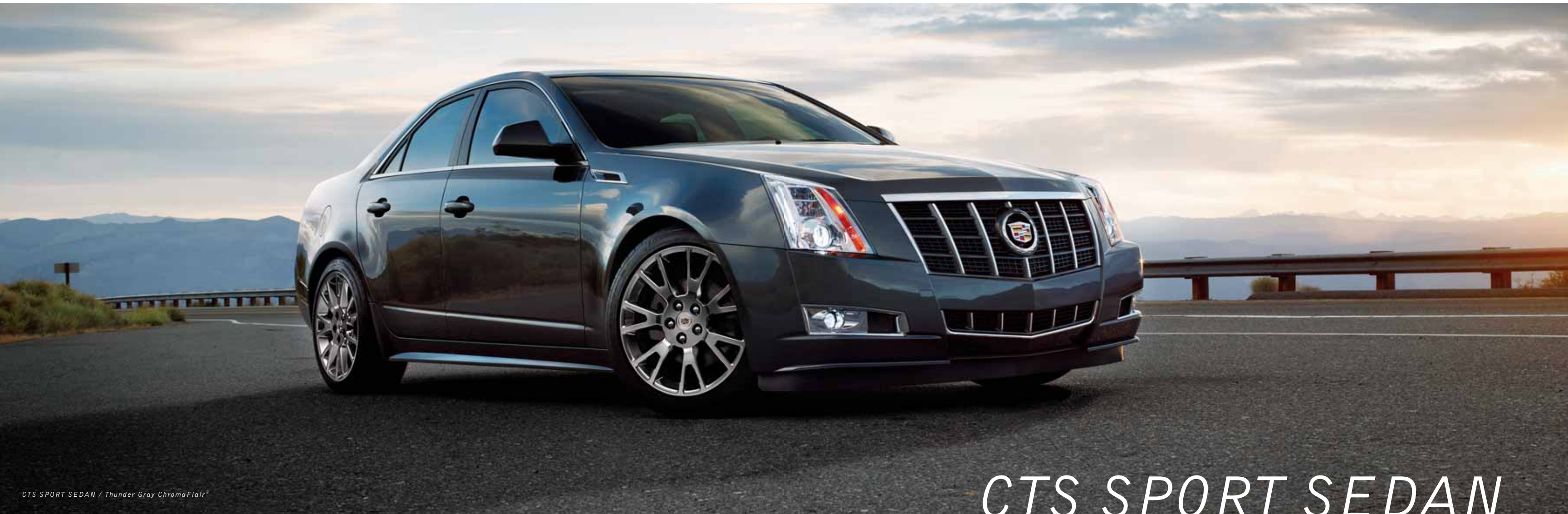
CTS SPORT SEDAN / Thunder Gray ChromaFlair®