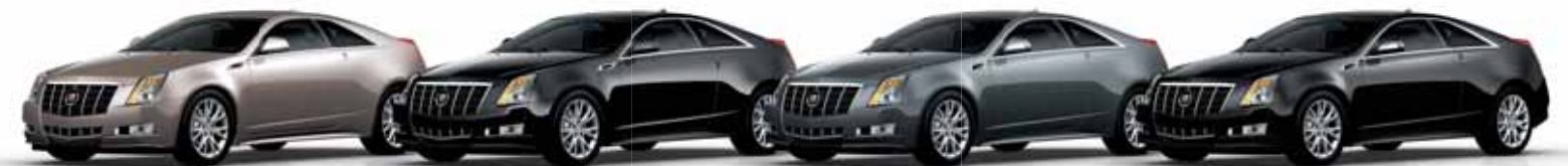
MOCHA STEEL METALLIC