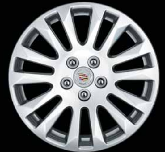
18" CAST ALUMINUM WHEELS WITH PREMIUM MULTI-COAT PAINTED FINISH

Standard and with Luxury Collection on CTS Sport Sedan and CTS Sport Wagon Size: 17" x 8" front and rear