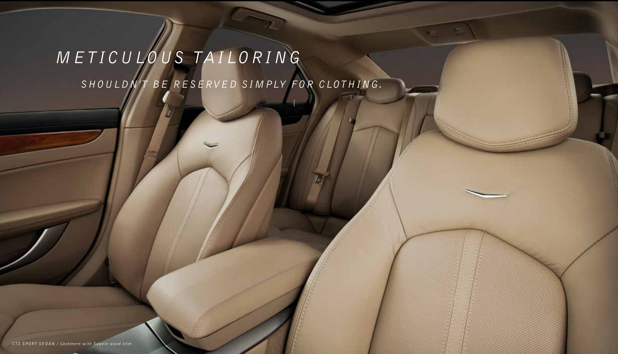
CTS SPORT SEDAN / Cashmere with Sapele wood trim

SHOULDN'T BE RESERVED SIMPLY FOR CLOTHING.