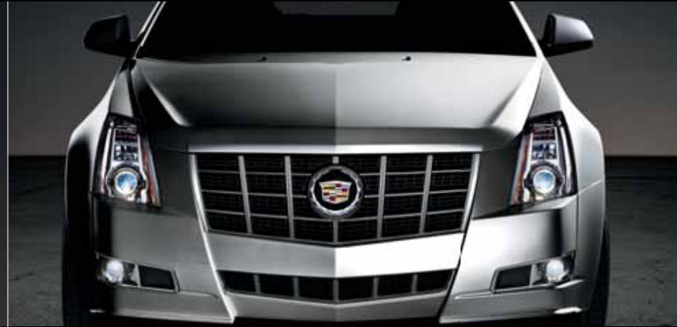
CTS SPORT SEDAN