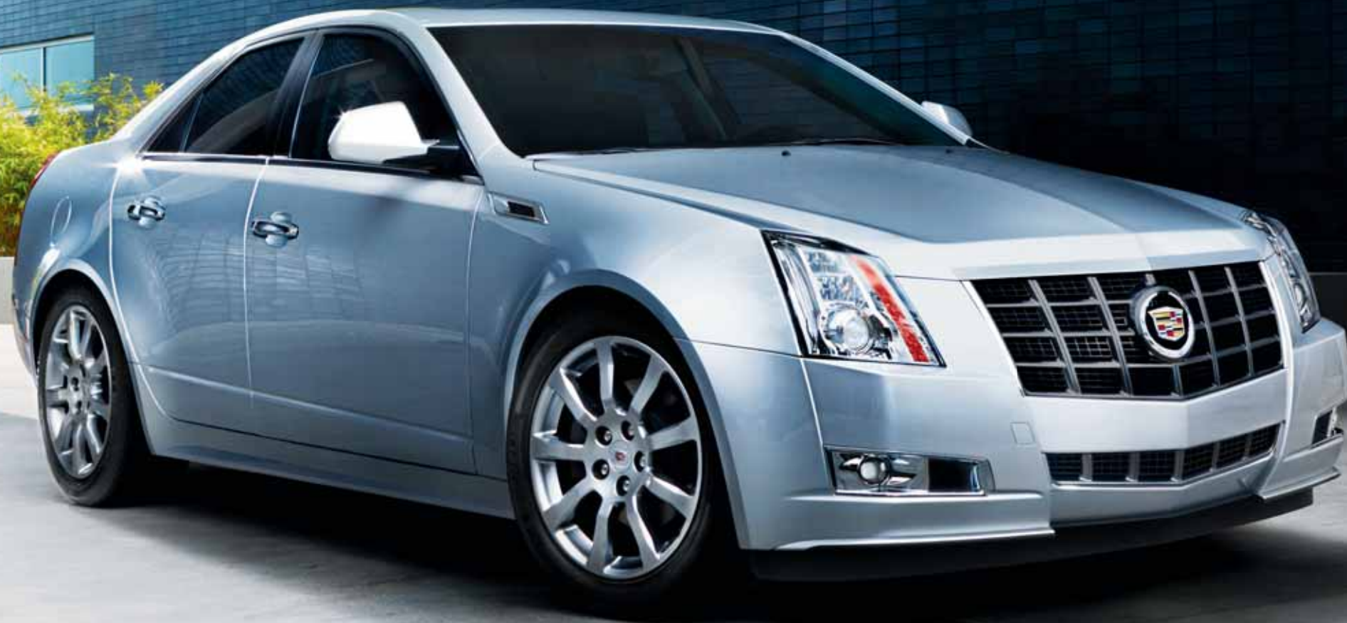
CTS SPORT SEDAN with Touring Package / Radiant Silver Metallic

The determined hood, the raked-back lines and athletic stance—everything about this design takes a distinctive stand. Enhancing its bold style and driving dynamics is an available Touring Package. For the Luxury Collection, the Touring Package includes a dark-accented grille, High-Intensity Discharge (HID) headlamps, fog lamps, chrome-accented door handles, dual-exhaust outlets and 18" aluminum wheels with Nickel Pearl finish. Premium Collection models with the Touring Package add 19" polished aluminum wheels. As your eyes work their way back, there's a rear spoiler shared with the world-class CTS-V—not only is it a strong visual cue, it generates downforce for added stability.