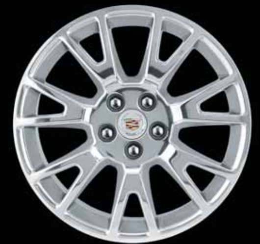
19" POLISHED CAST ALUMINUM WHEELS

Standard on Premium Collection; available with Performance Collection Sedan/Wagon size: 18" x 8.5" front and rear Coupe size: 18" x 8.5" front/18" x 9" rear