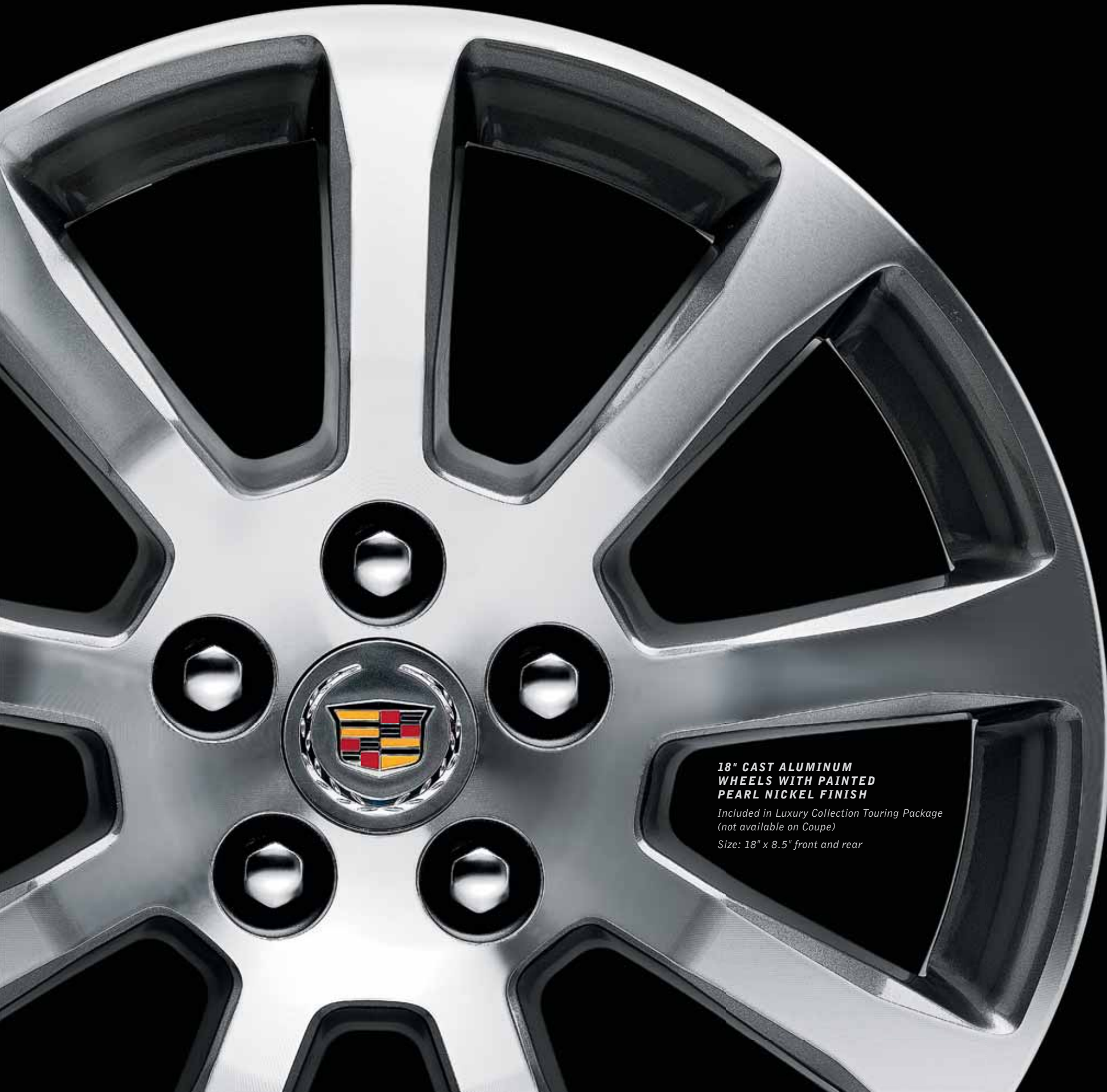
18" CAST ALUMINUM WHEELS WITH PAINTED PEARL NICKEL FINISH Included in Luxury Collection Touring Package (not available on Coupe) Size: 18" x 8.5" front and rear